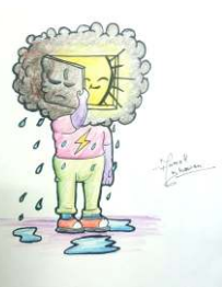
ANMOLL - (XI-D)