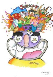
KUSHRAJ - (XI-B)