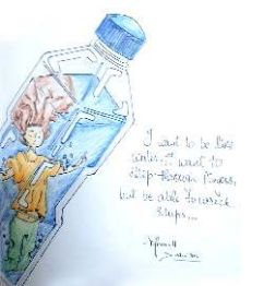
ANMOLL - (XI-D)