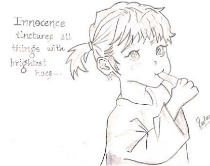
RAVLEEN KAUR - (XI-B)