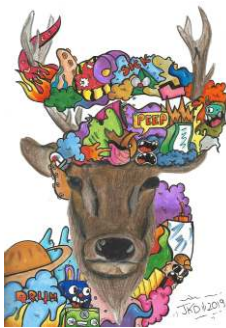
KUSHRAJ - (XI-B)